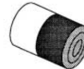
Bimetal Cans (Aluminum & Tin)